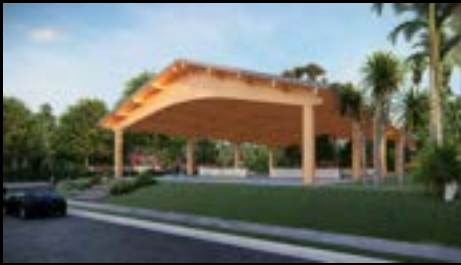
Peak & Camber